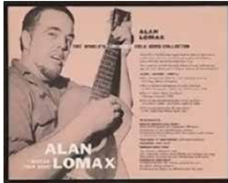
"Alan Lomax: The World's Foremost Folk Song Collector" publicity brochure for the Keedick Lecture Bureau, ca. 1960

This post seems an opportune moment to celebrate the many people who have contributed. Acquisition of the Alan Lomax Collection was made possible through