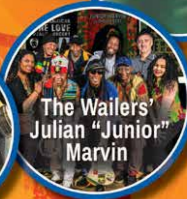
The Wailers' Julian "Junior" Marvin