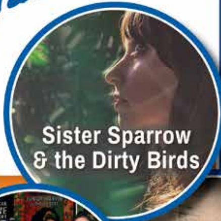
Sister Sparrow & the Dirty Birds