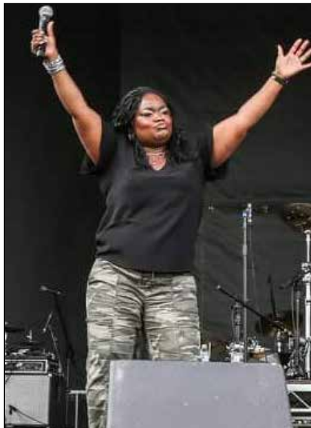
Shemekia Copeland is a favorite performer at the CBBF, after several years of soaring singing.