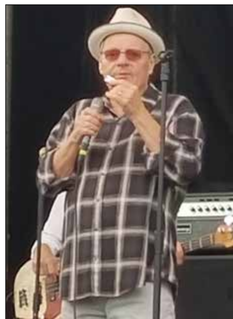
Veteran blues singer Delbert McClinton performed at the first CBBF in 1998 and again this year.