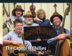
The Capitol Hillbillies