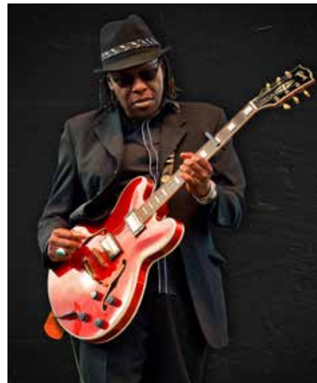
The guitar virtuosity of blues legend Joe Louis Walker will entertain and enthrall at his July 27 appearance for DCBS.

Walker's latest, highly-acclaimed album, Everybody Wants A Piece , from Mascot/Provogue, cements his legacy as a prolific torch bearer for the blues. Looking back on his rich history, Walker shares, "I'd like to be known for the credibility of a lifetime of being true to my music and the blues. Sometimes I feel I've learned more from my failures, than from my successes, but that's made me stronger and more adventurous, and helped me create my own style. I'd like to think that when someone puts on one of my records they would know from the first notes, 'That's Joe Louis Walker.'"