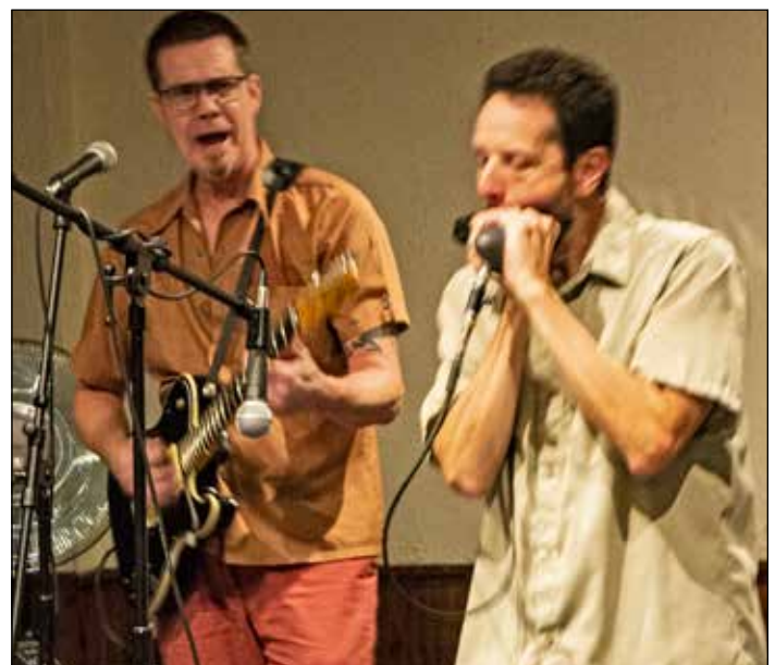
High energy should be their middle name! Members of the Cadillac Jump Blues Band gave a tight performance at the FUNraiser on Saturday, July 20. More photos from the event to raise funds for the free DC Blues Festival are on page 7.